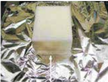
Place the foam sample in the center of the joined foil sheet lengthwise on top of the seam.