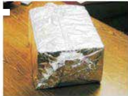
The finished foil wrapped sample should be tightly sealed on all sides.

Remember: Only one sample per foil package.