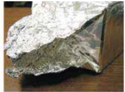
Pinch the foil on the ends and squeeze together.