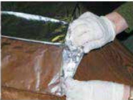
Roll the ends twice and press flat against the foam block.