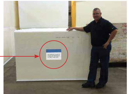
Take a photo of chemist or supervisor next to foam block from which sample was taken. On foam block, print on a label, this information:

Remember: Only one sample per foil package.