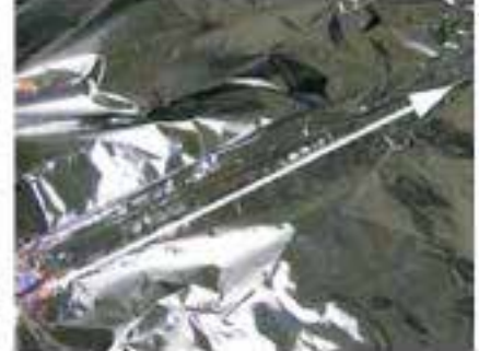
Lift the overlap, crease and fold flat for the length of the seam (26").