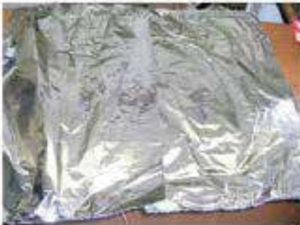
Use 18" wide heavy duty aluminum foil. Place two 26" pieces side-by-side.

Note: Before taking samples, review details on page 6.