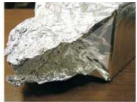
Pinch the foil on the ends and squeeze together.