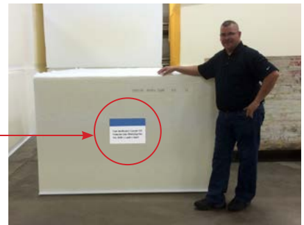
Take a photo of chemist or supervisor next to foam block from which sample was taken. On foam block, print on a label, this information:

Remember: Only one sample per foil package.