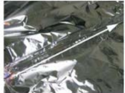
Lift the overlap, crease and fold flat for the length of the seam (26").