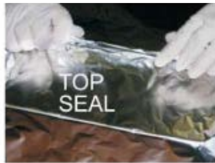
Join the side panels together at the top. Pinch the overlap, roll over twice and fold flat to seal.