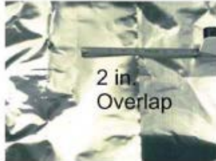
Overlap the two pieces by 2" – lengthwise.