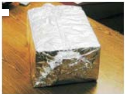
The finished foil wrapped sample should be tightly sealed on all sides.

Remember: Only one sample per foil package.