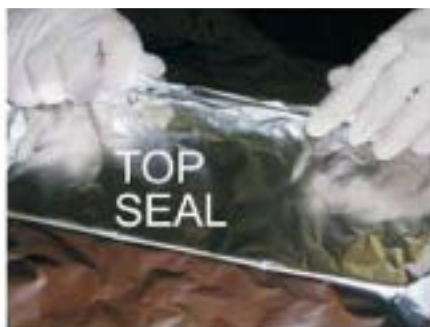
Join the side panels together at the top. Pinch the overlap, roll over twice and fold flat to seal.