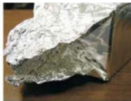
Pinch the foil on the ends and squeeze together.