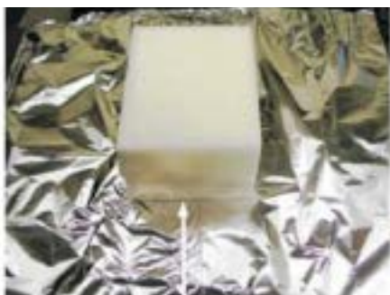
Place the foam sample in the center of the joined foil sheet lengthwise on top of the seam.