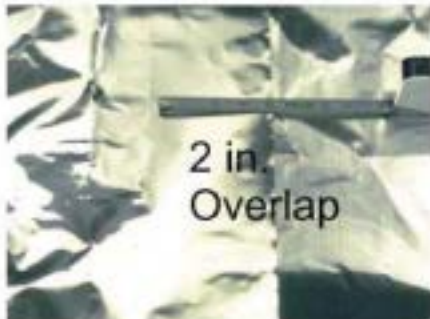
Overlap the two pieces by 2" – lengthwise.