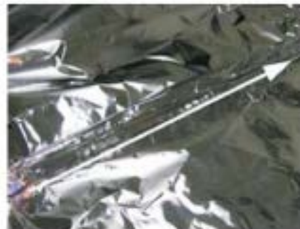
Lift the overlap, crease and fold flat for the length of the seam (26").