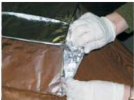
Roll the ends twice and press flat against the foam block.