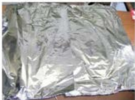
Use 18" wide heavy duty aluminum foil. Place 2, 26" pieces side-by-side.

Note: Before taking samples, review details in Section 6.