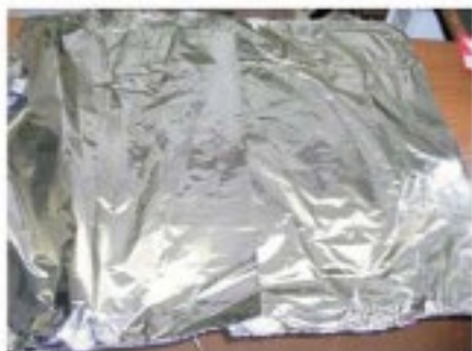
Use 18" wide heavy duty aluminum foil. Place 2, 26" pieces side-by-side.

Note: Before taking samples, review details in Section 6.