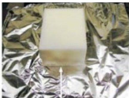
Place the foam sample in the center of the joined foil sheet lengthwise on top of the seam.