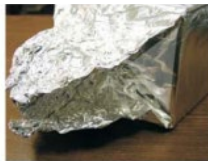
Pinch the foil on the ends and squeeze together.