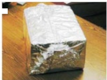
The finished foil wrapped sample should be tightly sealed on all sides.

Remember: Only one sample per foil package.