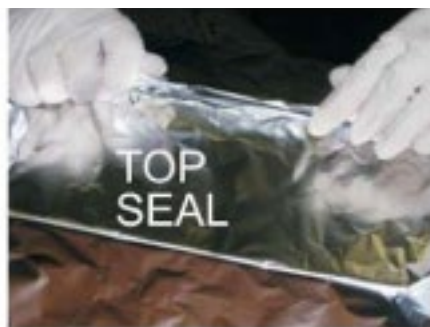
Join the side panels together at the top. Pinch the overlap, roll over twice and fold flat to seal.