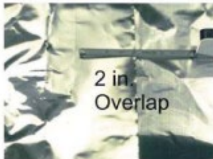
Overlap the two pieces by 2" – lengthwise.