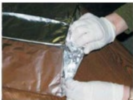
Roll the ends twice and press flat against the foam block.