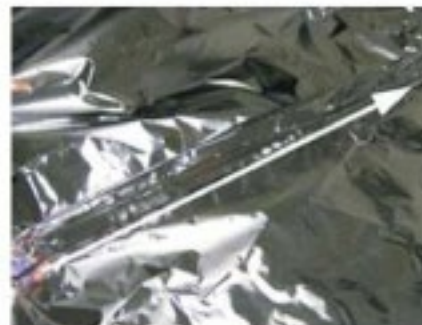
Lift the overlap, crease and fold flat for the length of the seam (26").