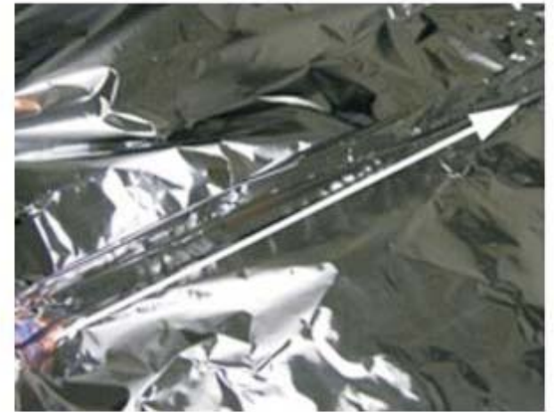
Lift the overlap, crease and fold flat for the length of the seam (26").