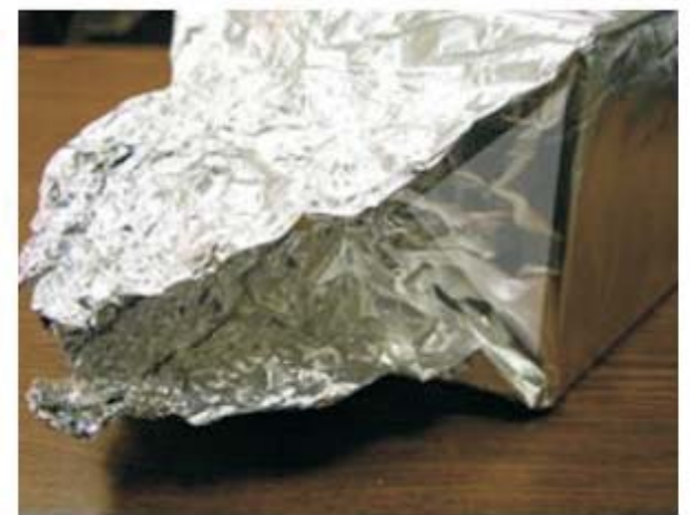
Pinch the foil on the ends and squeeze together.