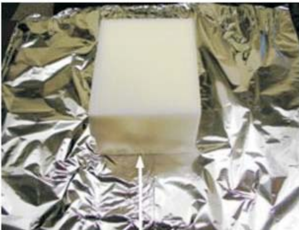
Place the foam sample in the center of the joined foil sheet lengthwise on top of the seam.