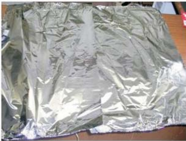
Use 18" wide heavy duty aluminum foil. Place 2, 26" pieces side-by-side.